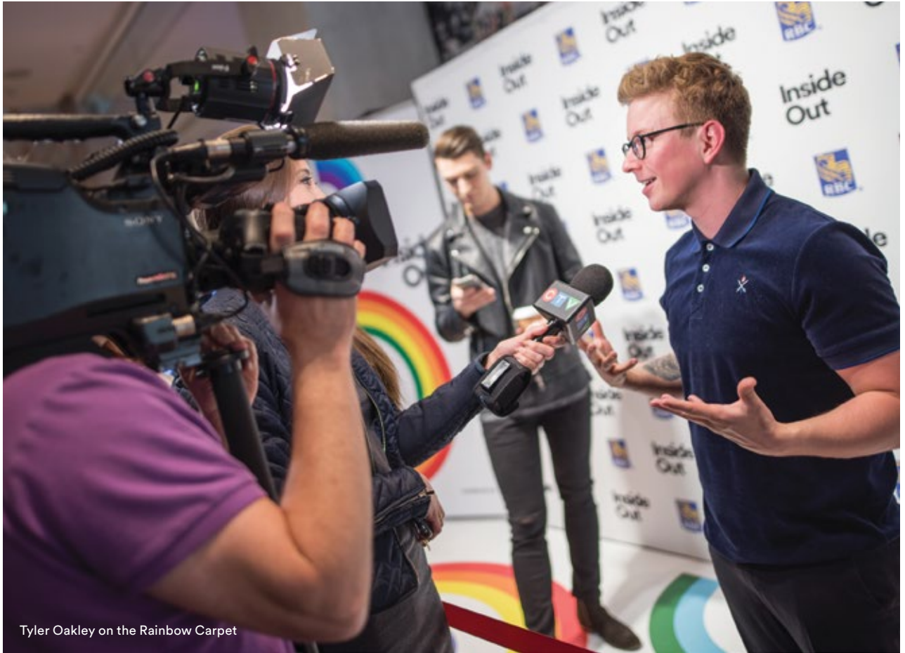
Tyler Oakley on the Rainbow Carpet